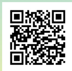
Scan QR for camps and clinics